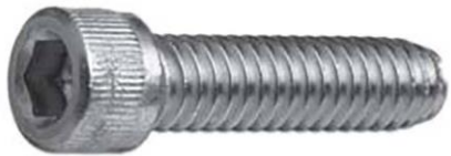
M6X40 (x8) for front for middle for rear